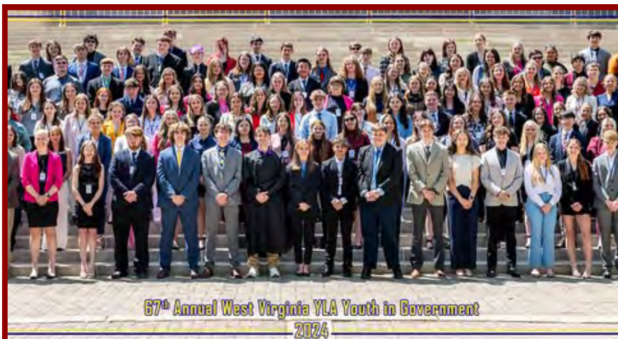
67 th Annual West Virginia YLA Youth in Government 2024