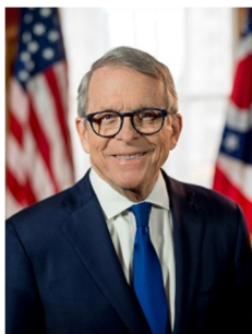
Mike DeWine Governor State of Ohio